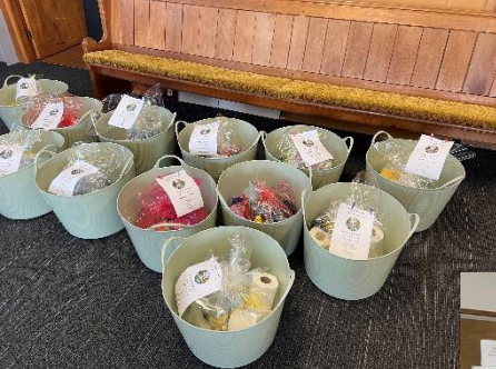
There are still a lot more welcome gifts to be provided